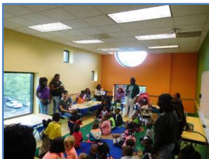
Children listened to a story during Astonishing Animals educational session at the museum.

Children and parents were thrilled to enter the museum to see the world largest 10 year old boy. The children were even more excited to explore Eddie as they listened to his stomach growl, his heart beat and air passed through his lungs.