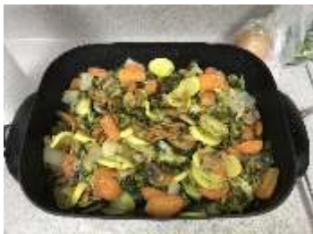
Parents with children in the Early Head Start Program, enjoy a stir-fry at their parent meeting, "How to prepare a nutritious meal on a budget."

We are enjoying having the Early Head Start Program at Newberry Child Development Center. It has not only benefited our facility through giving low income families a chance to have an early start on education, but also has enabled NDCD to help build Newberry's community brighter one child at a time. The program has allowed us to create lasting partnerships with parents and their children. The program also provides great resources for our parents and their families. We are privileged to have this program in our facility. Thank you!