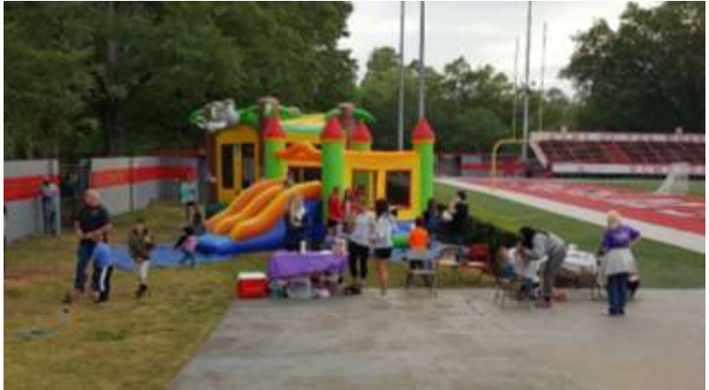
PAT families enjoyed participating in the ten year celebration of Newberry County School District's Family Literacy Program.

A family with a 49-month old child enrolled in our program and our Bright Beginnings Child Development Center. He had been born with congenital heart problems and had resulting surgeries. His mother was understandably very concerned and protective, but was more comfortable with his being in a small class. His pre-screening showed some deficiencies in communication, fine motor, problem solving, and social skills. The child progressively learned to follow the class routines, play with the other students, and participate in class activities. His mother was surprised at his gains in maturity and independence, and as a result became a full partner in his developmental and educational goals. She and his father become more active in the parenting group sessions. His mother was our guest speaker at our Spring Council meeting to share her families' journey with our program this year. His post-screenings showed improvements in all areas, but it was decided to have him evaluated by School District Special Services, in hopes of his qualifying for services over the summer. His mother plans to bring him back to our center for the 2016-17 school year, as well as participate in the 2016 summer activities.