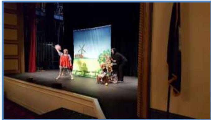
Newberry County preschoolers enjoyed Porkchop Production’s, “Bremen Town Musicians” during the Week of the Young Child.

“Our daughter is always excited to receive a new book from school. She “reads” it to us before she asks us to read it to her. The new stories encourage her to go back and look at the old ones. Many, many thanks for encouraging children to love books.” Preschool Parent