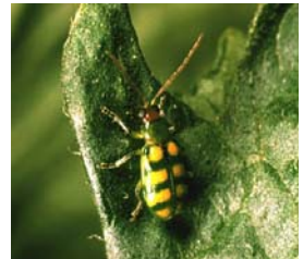
Banded Cucumber Beetle

Larvae of both the banded cucumber beetle, and the spotted cucumber beetle, feed on the roots of sweet potatoes.