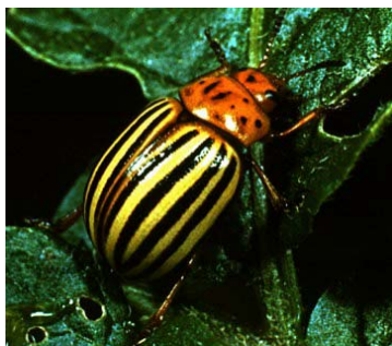
Colorado Potato Beetle - Adult

Universally known among growers as the potato bug, this insect was long considered the most dangerous enemy of Irish potatoes and is still capable of doing much damage and can be a serious pest of tomatoes or eggplants. It is now found in most regions where potatoes are grown.