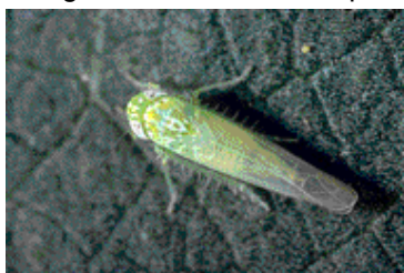
Potato Leafhopper

The adult is pale green, somewhat wedge-shaped, about one-eighth inch long, with small white spots on the head. Adults are very active, jumping or flying when disturbed. Females deposit slender white eggs within the stems and larger veins of the leaves.