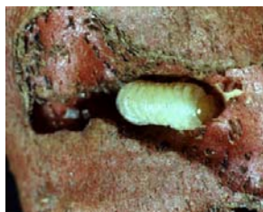
Grub on Sweet Potato

Grub injury to sweet potatoes occurs in most areas where the crop is grown. There are many species of grubs and several of them feed on