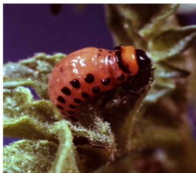
Colorado Potato Beetle - Larva

Adults are stout, oval, convex beetles, about three-eighths of an inch long, with 10 black and yellow stripes running lengthwise along the wing covers. Overwintering beetles hibernate in the soil, emerging in the