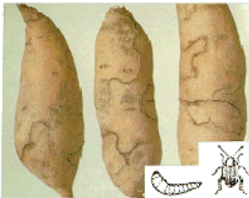
Sweet Potato Flea Beetle

Adult beetles are black, about a sixteenth of an inch long, and usually hop away when disturbed. They are easily recognized by the tendency to eat narrow grooves in the upper surface of sweet potato leaves.