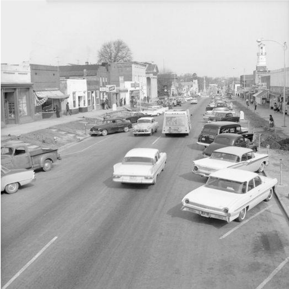
Here's a look back at traffic on US 321 Business in downtown Winnsboro in Fairfield County, shown here in April 1962.