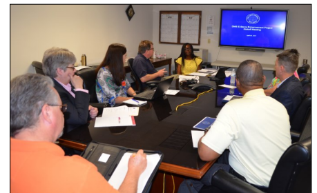
Focus group members discuss the project.

ments users are allowed to file at one time in the E-File System and adding a watermark along the margin of E-Filed documents, to name a few. Phase I is to be completed by June 30, 2017.