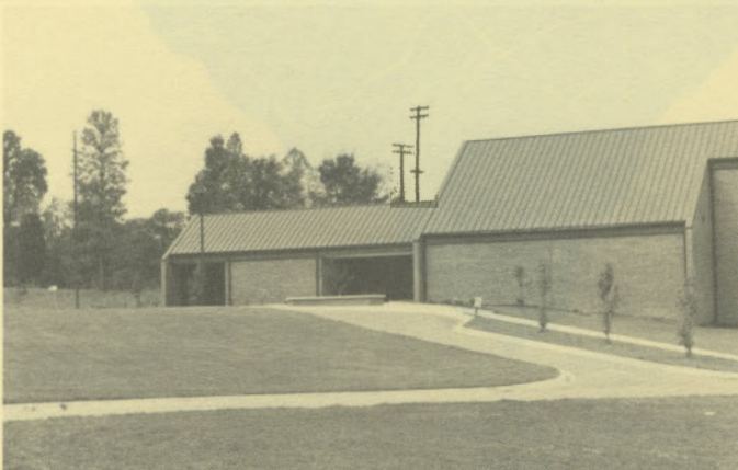
York Recreation Center