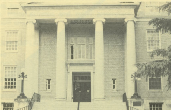
York County Courthouse