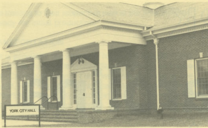
York City Hall