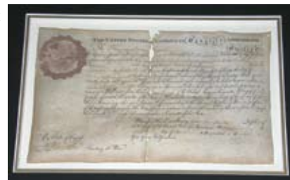
Francis Marion Commission

For more information about Gen. Francis Marion, go to www.fmarion.edu/news/generalmarion .