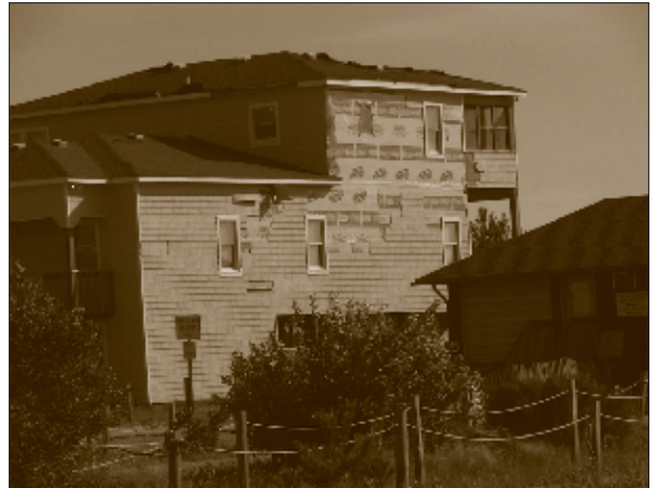
Hurricane Irene tore siding off this building in Kitty Hawk, N.C., damaging the structure's "envelope" that should protect it from high winds.

Pang and Schiff have created a computer model that simulates a Hurricane Hugo-sized catastrophic storm hitting northern Charleston County—the same location where Hugo made landfall in 1989. The simulated storm was directed into a