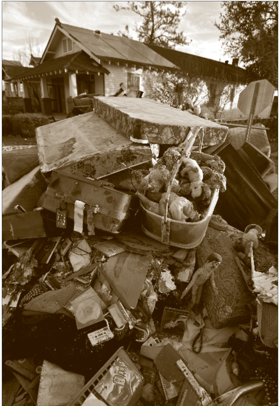
LOST CHILDHOOD. Three days of cleanup after Hurricane Katrina in New Orleans left ruined children's toys and other debris at the curb.

Children separated from a parent or caregiver at the time of the screening suffered increased trauma symptoms. Children also had more trauma symp-