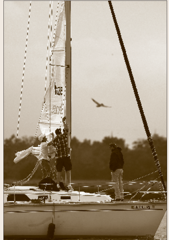
TEAMWORK. A Veterans on Deck sailboat.

Acierno realized that the veterans need another therapeutic step toward recovery. "Therapy without social and community interaction isn't enough."