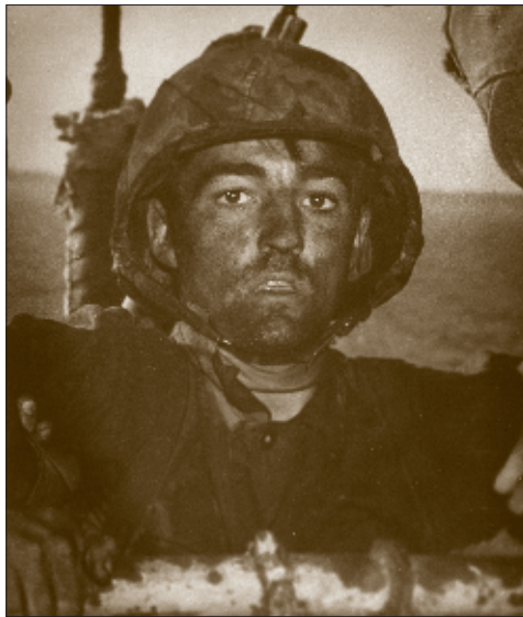
SHELL-SHOCKED. This Marine exhibited a "thousand-yard stare" after combat in World War II.

A McClellanville man who asked that his name be withheld was 15 years old when he and his family experienced Hugo's terrifying storm surge. One night, weeks after the hurricane, a booming thunderstorm hit the town. "Yeah, I was frightened again," he says.