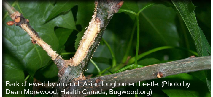
Bark chewed by an adult Asian longhorned beetle.

To prevent spreading this beetle, infested trees should be destroyed by chipping on site, and the stump should be