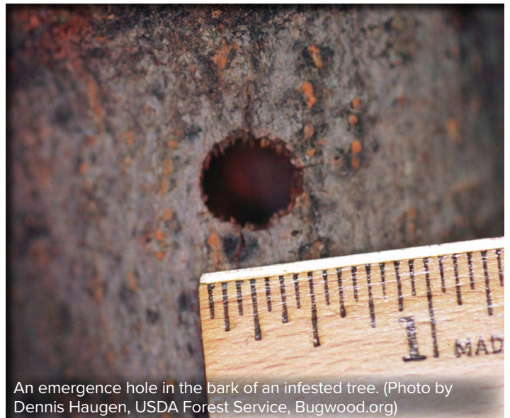
An emergence hole in the bark of an infested tree.