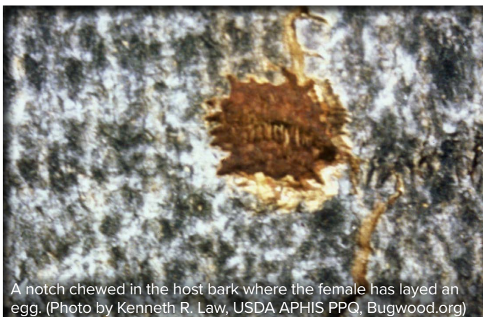
A notch chewed in the host bark where the female has laid an egg.

If you think you have seen Asian longhorned beetle or its damage, please contact the South Carolina Forestry Commission at (803) 667-1002 or djenkins@scfc.gov .