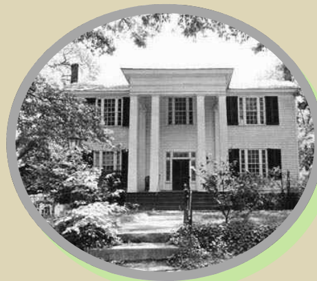
Williams-Earle House, Greenville