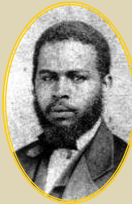
Robert Smalls at age 30.

At about 3 a.m. on May 13, 1862, while the White crew was ashore, Smalls boarded The Planter , which was loaded with armaments for the rebel forts, and quietly sailed the boat to a nearby dock where he loaded his wife, children and 12 other slaves. He then fearlessly sailed the boat through the harbor giving the correct whistle signal as he passed each rebel fort. He then turned the boat towards the nearest Union blockading ship and made a break for it. As Smalls approached the USS Onward , the ship's captain prepared to fire. Before the guns were fired, Smalls raised the white flag of surrender. He then sailed The Planter alongside the Onward and shouted, "Good morning, sir! I have brought you some of the old United States' guns, sir!"