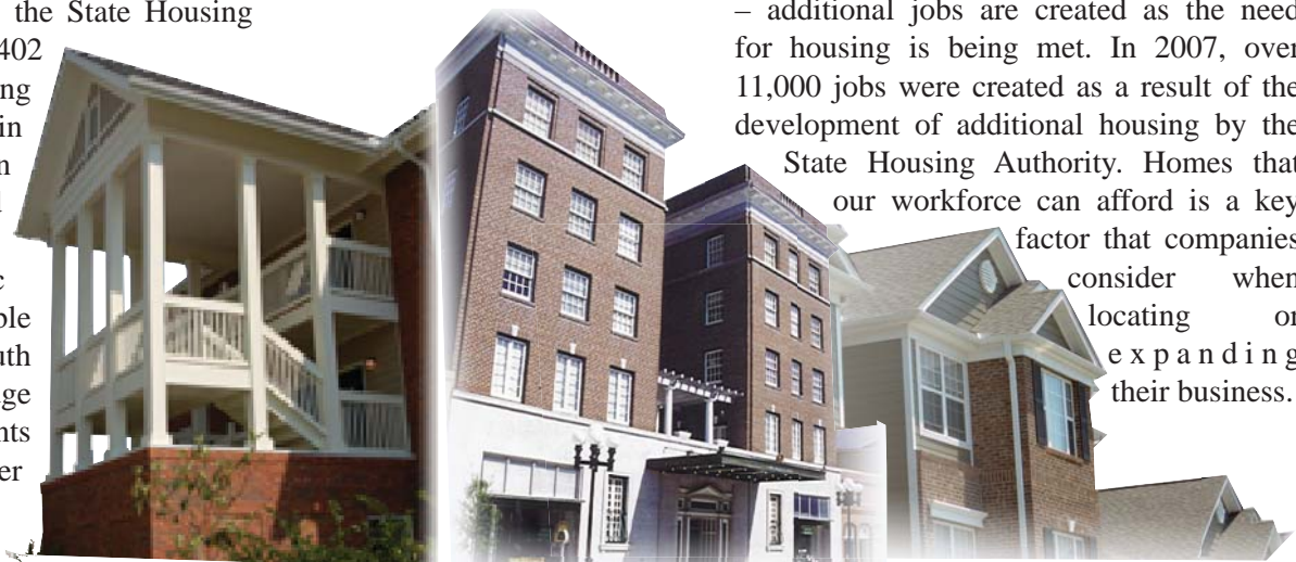
Seven Farms Charleston, SC

The creation of additional housing gives South Carolina an advantage in attracting investment and creating jobs. While providing affordable housing for our citizens, our investments also provide work for thousands of individuals either directly or indirectly. Whether they are carpenters, electricians, real estate agents, or retailers – additional jobs are created as the need for housing is being met. In 2007, over 11,000 jobs were created as a result of the development of additional housing by the State Housing Authority. Homes that our workforce can afford is a key factor that companies consider when locating or expanding their business.