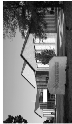
Performing Arts Center located in downtown Florence at 201 South Dargan Street

FMU is located seven miles east of I-95 and Florence. From I-95, take Exit 170 onto S.C. Highway 327 and follow the signs to FMU.