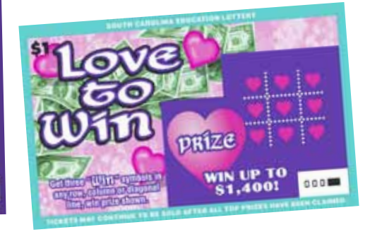
Artwork shown is not necessarily representative of final product and is subject to change.