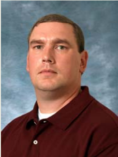
David Cummings Housing