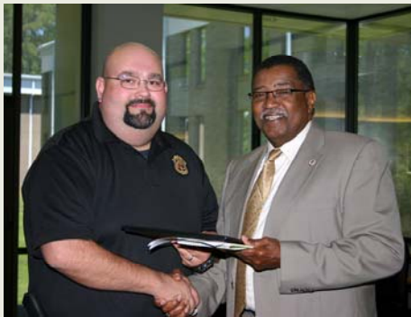
Eric Brown Outstanding Instructor Award Advanced Training