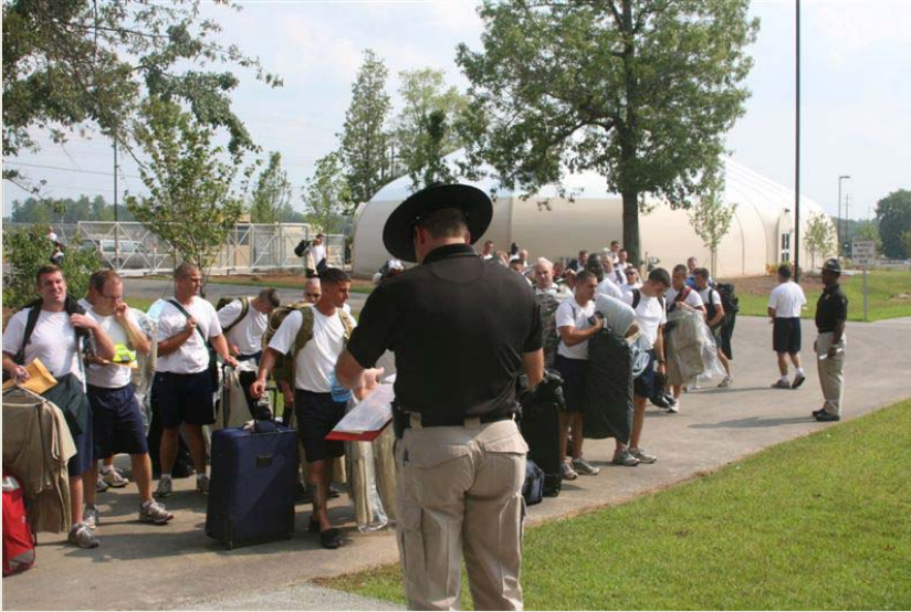
B573 the first twelve week basic class reports for training in the new Basic Law Village on July 10.