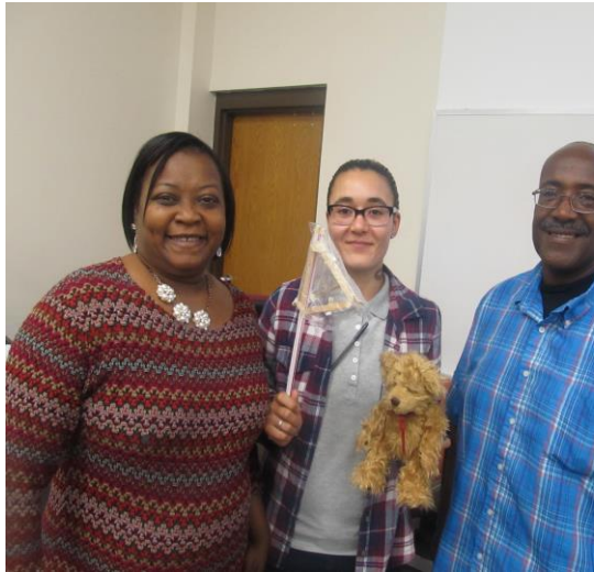
Board Members and Staff having fun at the Early Childhood Conference at Lander University!