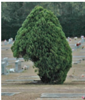
A graceful and beautiful arborvitae butchered by inappropriate pruning.

straight forward, repairing breaks that were either caused by vandalism or natural events. One stone received a poultice to remove paint on its stucco.