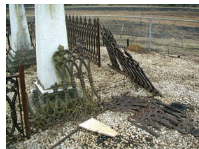
Before and after photographs of a fence treated by Chicora's conservators at Richardson Cemetery in Clarendon County, SC.

Two thin coats are always better than one thick coat and will keep the fence looking good for years.