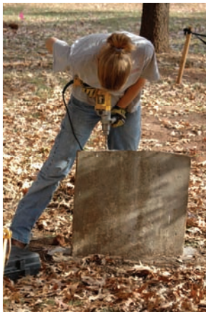
Conservator Nicole Southerland drilling one of the cemetery’s broken stones for insertion of threaded stainless steel rods.

The “rumors” were true — the church had purchased a 0.4 acre cemetery years ago as part of their church lot. Mystery solved — showing how often historic research can be as productive as field investigations!