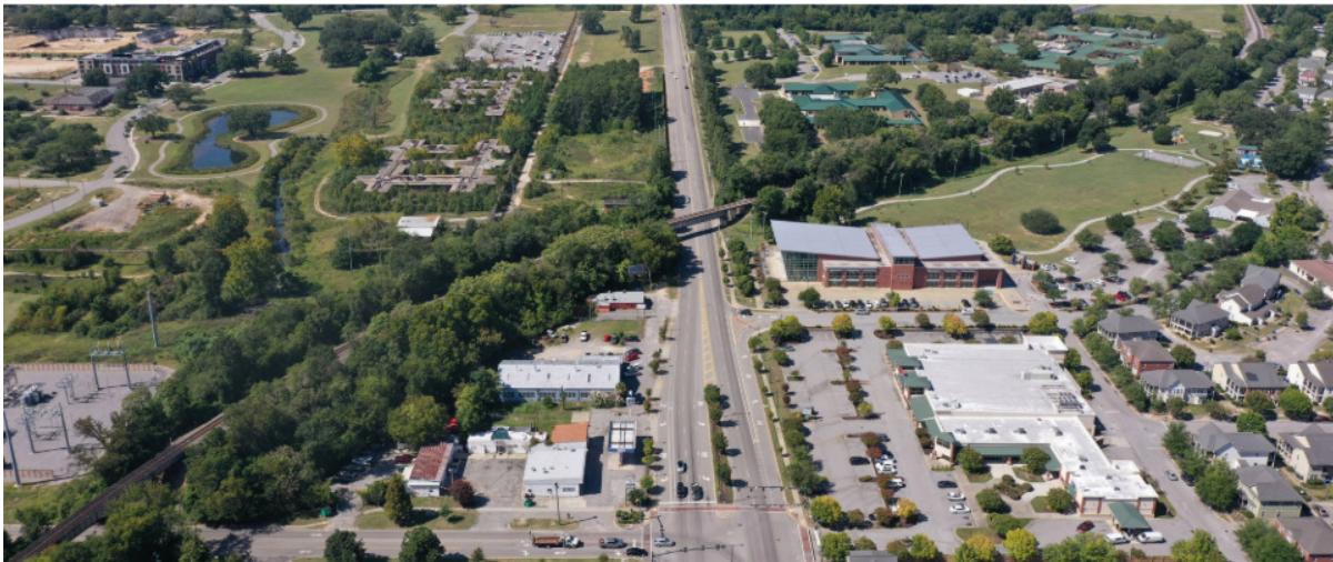
This aerial snapshot (top) from 1956 takes a look back at the Harden Street Extension in Columbia. The photo below is of the same area taken in September 2024.