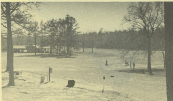
Kershaw Golf Club