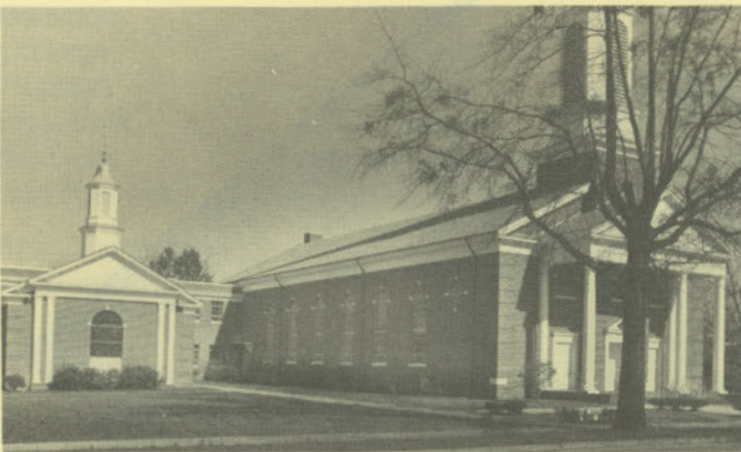
First Baptist Church