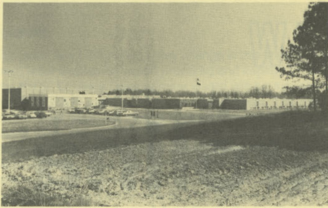
Andrew Jackson High School