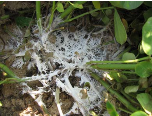
White mycelium & limb rot of White Mold.