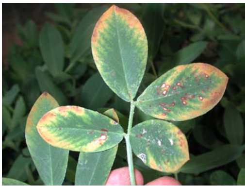
Boron toxicity – marginal burn