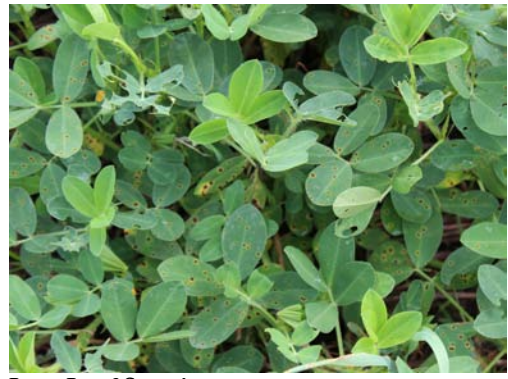
Late Leaf Spot in peanut canopy.