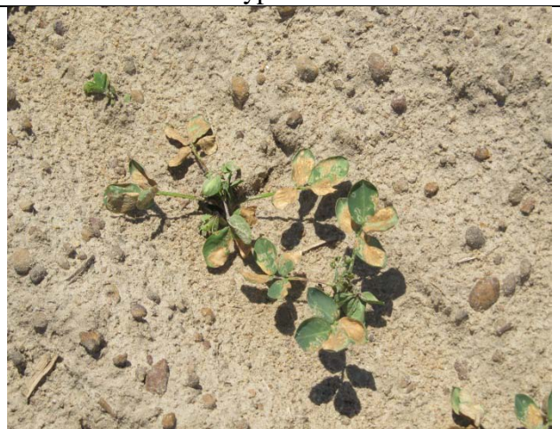
Paraquat + Storm + Dual Magnum