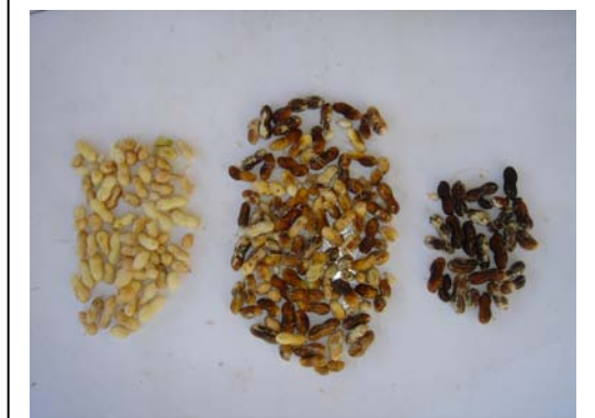
35% Wh+Y, 52% Or, 13% Br+Bl: 7-10 day