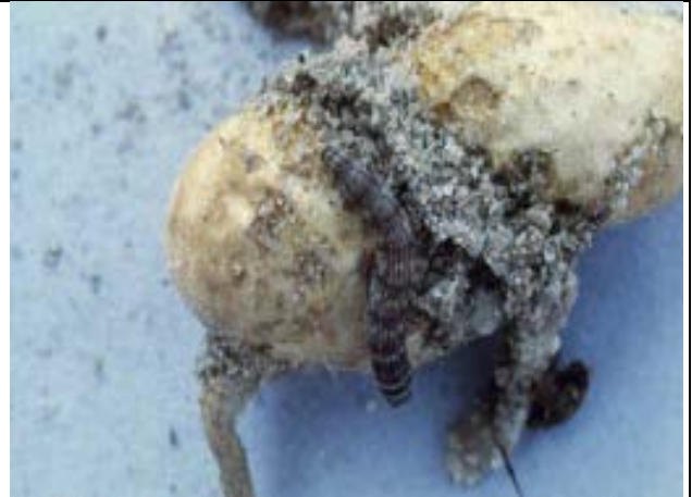
1 Lesser Cornstalk Borer Larva