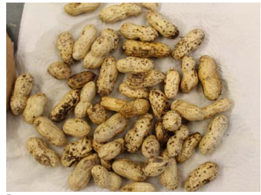
Damage caused by Lesion Nematode