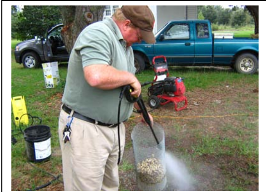
Need oscillating "turbo" nozzle, not high psi