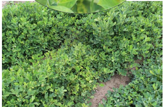
Resistance, In-Furrow Insecticides, and Planting Date are Key in Managing TSWV.