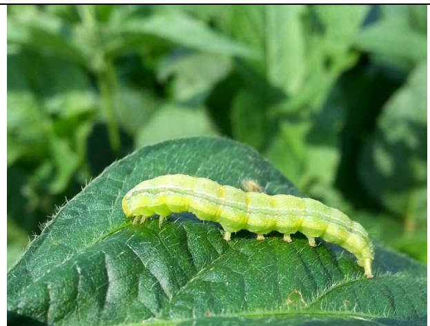
3 Velvetbean Caterpillar