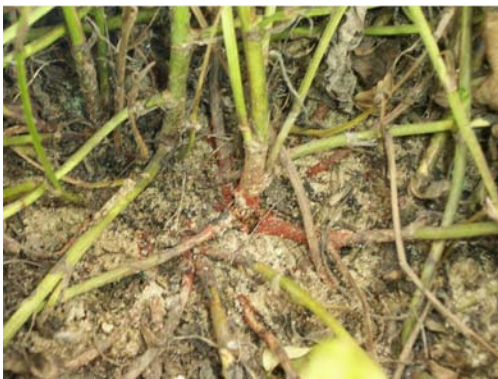
Red fruiting structures = CBR