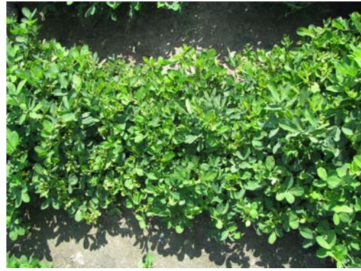
Stunting caused from TSWV.