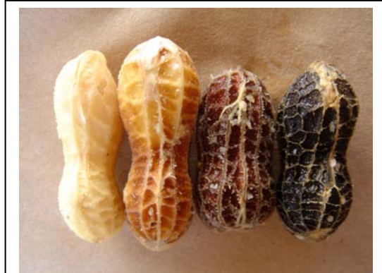
White-Yellow, Orange, Brown, Black pods.