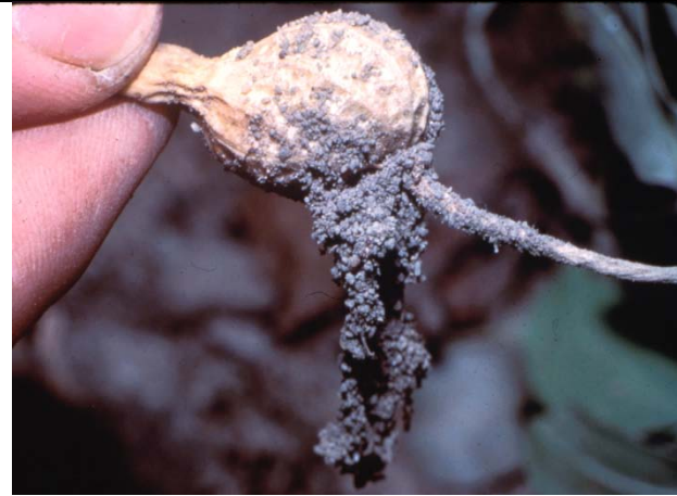
Lesser Cornstalk Borer Tubeon Pod