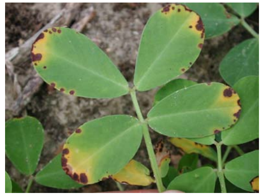
Thimet toxicity – peanuts will outgrow it