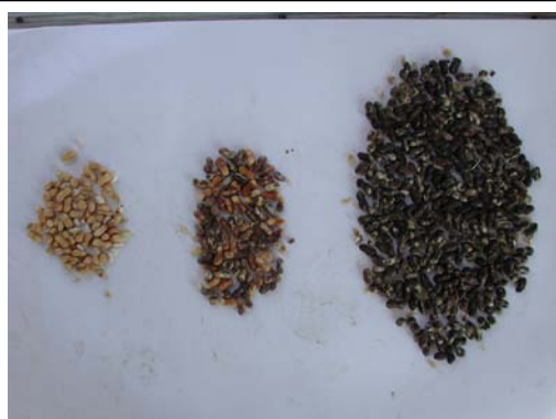
15% Wh+Y, 23% Or, 62% Br+Bl: Panic!!!