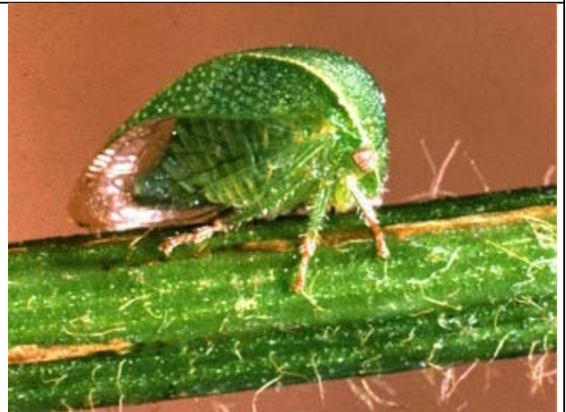
2 Three-Cornered Alfalfa Hopper