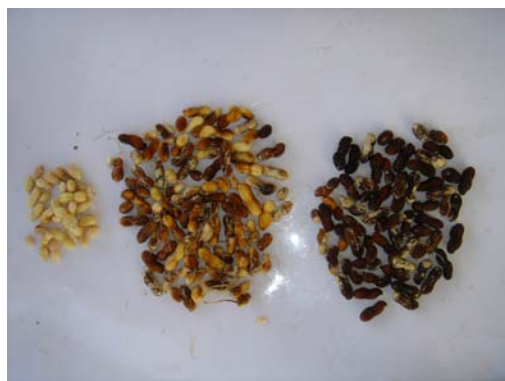
15% Wh+Y, 52% Or, 33% Br+Bl: Dig.