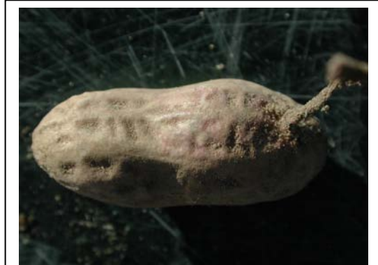
Pink Tinted Pods are Past Maturity: Dig!!!