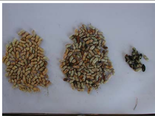
48% Wh+Y, 47% Or, 5% Br+Bl: ~ 2 weeks