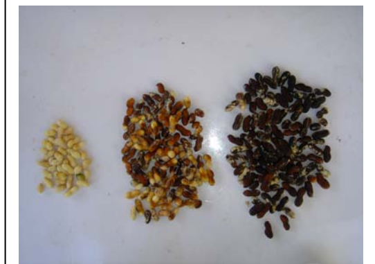
12% Wh+Y, 42% Or, 46% Br+Bl: Dig!!