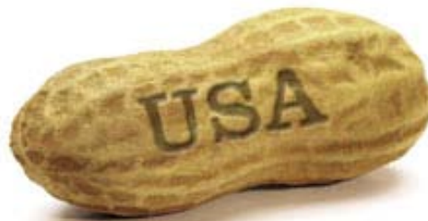
National Peanut Board™