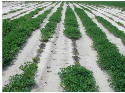
Zinc toxicity: check pH if soil test Zn > 6lb