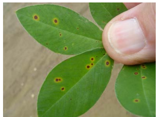
Not always disease! Surfactant burn spots.