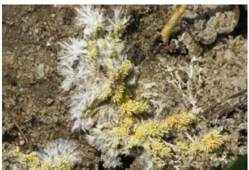
White mycelium & orange finger-like structures = False White Mold.