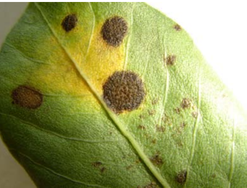
Late Leaf Spot - fuzzy spores on leaf back.