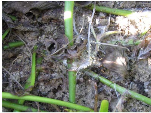
Cream to orange "BBs" = White Mold.