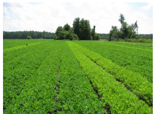
Nitrogen deficiency – no inoculant.