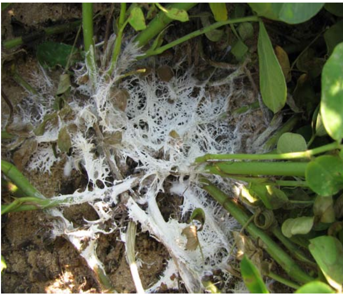
Fungicide Timing is Critical for White Mold Control.