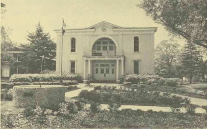
Hampton County Courthouse