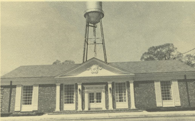
Hampton Town Hall