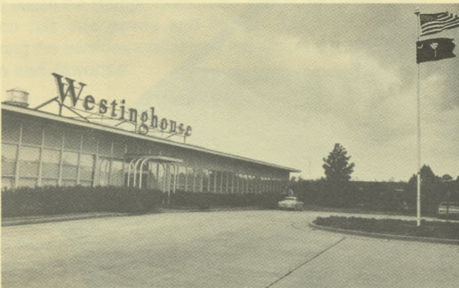
Westinghouse Electric Corp.