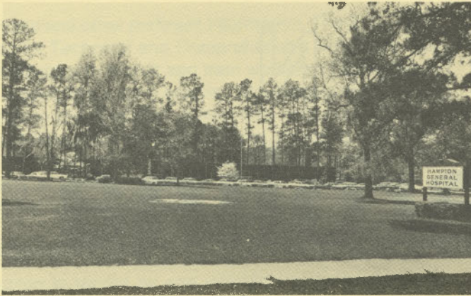
Hampton General Hospital