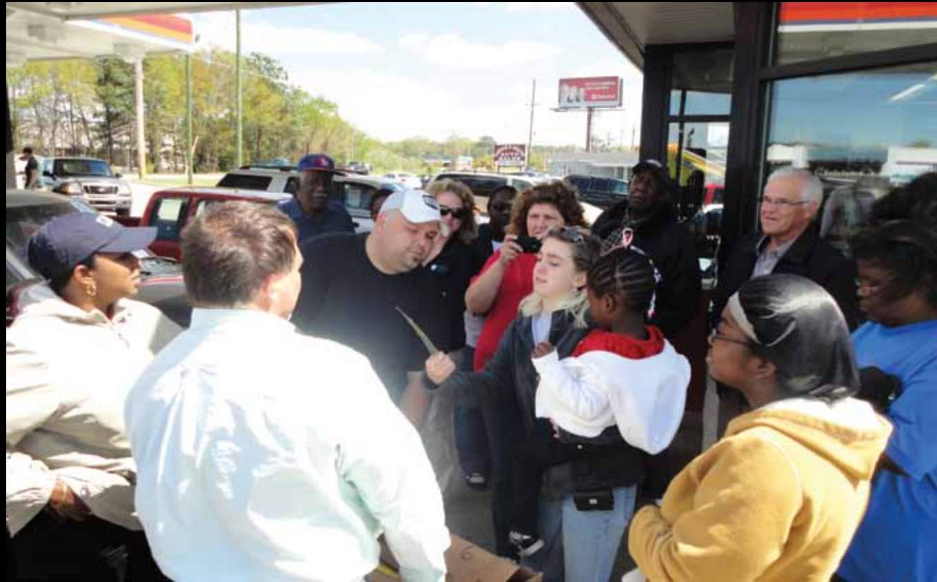
GATHER AROUND: Roberts Express Mart #3 in Newberry offered players in attendance a second-chance to win an entire pack of lottery tickets valued at $300. Players loved it!

COVER PHOTO: Special thanks to In N Out Convenience Store at 759 Rutledge Avenue in Charleston for providing an exciting promotion for its lottery players. The location offered lottery players a second-chance drawing to win a $50 gift card!