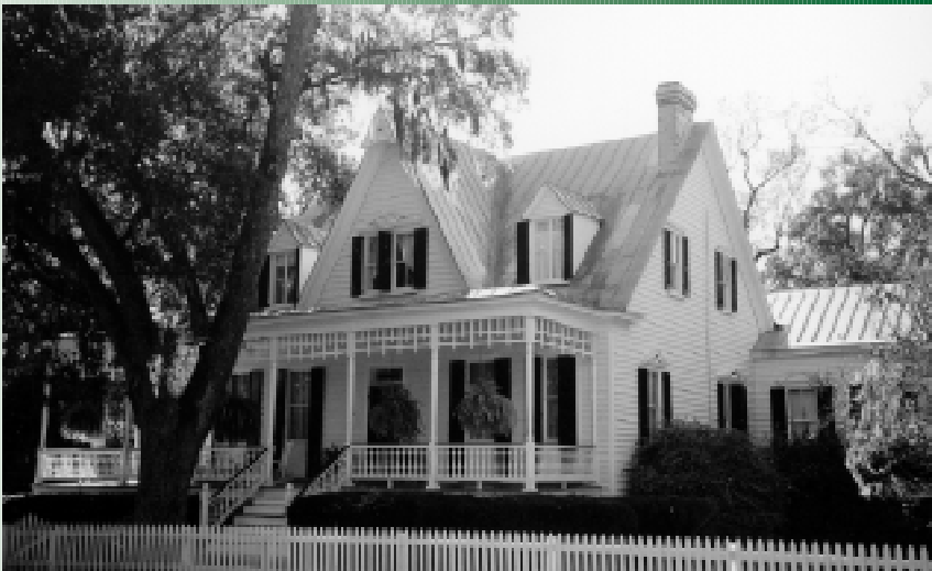
Summerville Historic District