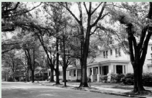
Hampton-Pinckney Historic District, Greenville

The City of Greenville adopted a preservation zoning ordinance in the late 1970s. The house price study focused on two locally designated districts, the Hampton-Pinckney Historic District and the East Park Avenue Historic District. Hampton-