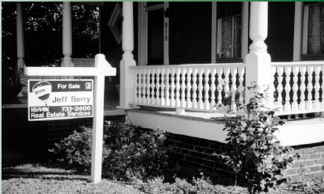
Elmwood Park Historic District, Columbia