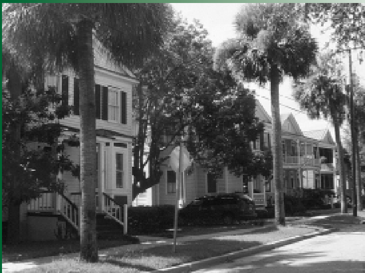
City of Beaufort Historic District

The City of Beaufort adopted a preservation zoning ordinance in 1972. The local historic district encompasses houses and commercial buildings, and it includes buildings from the colonial era to the early twentieth century. The research focused on the residential properties in the historic district. 5