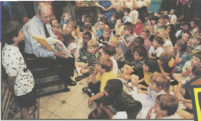
Governor Hodges reads to children in his office each week during the legislative session to encourage reading in the classroom as well as the home.