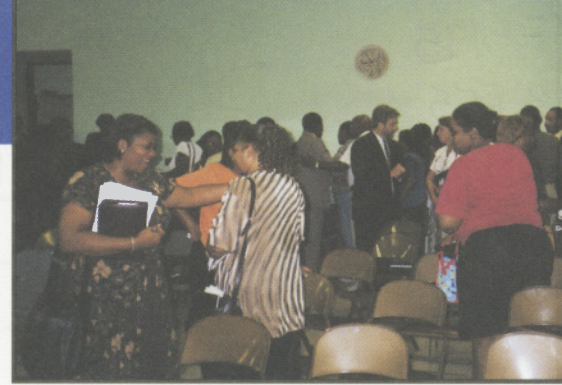
In Allendale County over 130 people turned out at the initial First Steps County Forum.