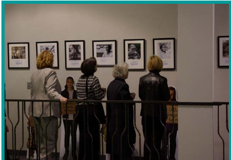
SC Heart Gallery Exhibit Center for the Arts, Rock Hill, SC January 22, 2009

If you have not visited the Heart Gallery website recently, please do so, as it has been updated with many new photos. Just go to http://www.scheartgallery.org .