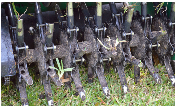
Core aeration uses a tool to remove small plugs of soil so that air and water can reach plant roots.

“Core aeration is better for long-term lawn health,” Jordan advises. “It helps grass grow thicker and stronger.”