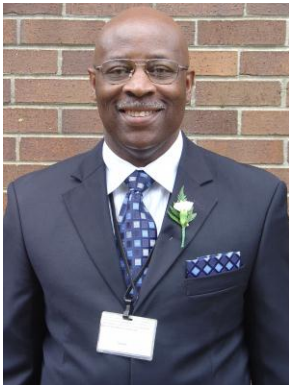
Rudolph Green Anderson-Oconee-Pickens CMHC