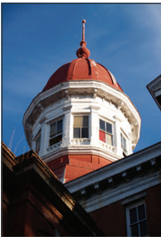
Babcock Building Cupola

DMH MISSION: TO SUPPORT THE RECOVERY OF PEOPLE WITH MENTAL ILLNESSES.