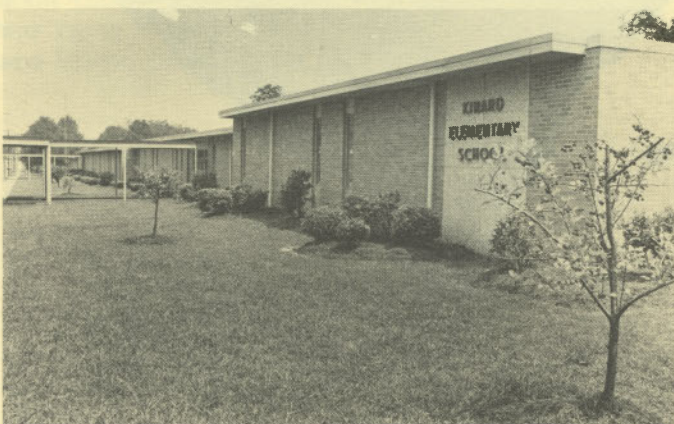
Kinard Elementary School