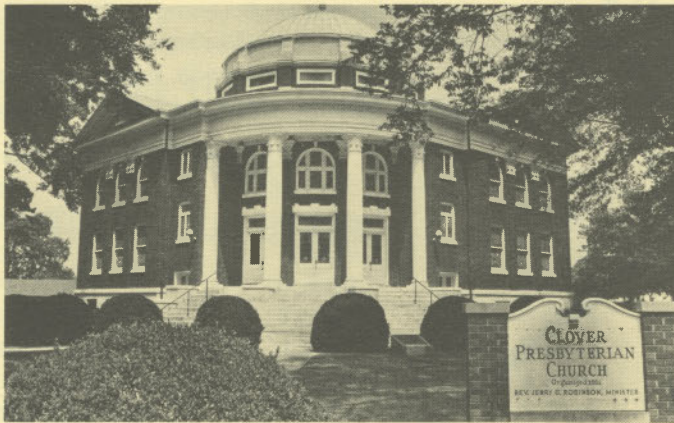
Clover Presbyterian Church