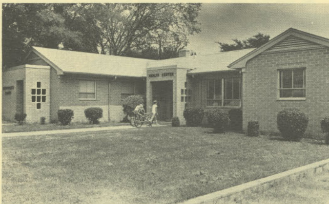
Health Center and Magistrate's Court Building