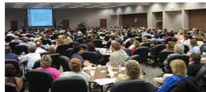
Attendees at the TechExpress technology institute for public libraries.

The Library Development Services department of the South Carolina State Library has conducted two surveys on Emerging Technologies in South Carolina's public libraries. The original survey was conducted prior to the TechExpress public library technology institute in the Fall of 2006. The first survey had 146 responses. Most responses came from public library staff who work in library administration (33.6%) and most people who responded were over the age of 50 (58.9%).