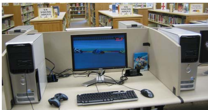
Carver's Bay Branch Library http://www.gclibrary.org/branches/carvers.asp

"I consider it best to take a 'wait and see' approach."