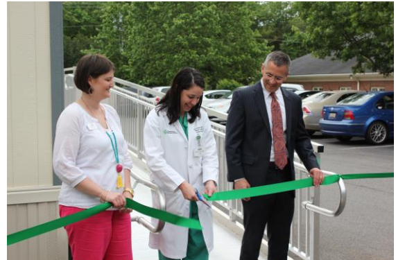
Staff from Greenville First Steps, Greenville Health System, and the YMCA at the ribbon cutting for the new childcare building for CenteringPregnancy

CenteringPregnancy is a CenteringPregnancy® is group prenatal care. Greenville First Steps partners with Greenville Health System and the YMCA of Greenville to fund a childcare center on site at the OB/GYN clinic. Too many mothers who already had children were unable to participate in CenteringPregnancy due to lack of childcare. By offering free childcare during sessions, more mothers are able to receive quality, group based prenatal care.