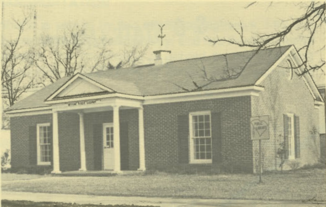
Bethune Public Library