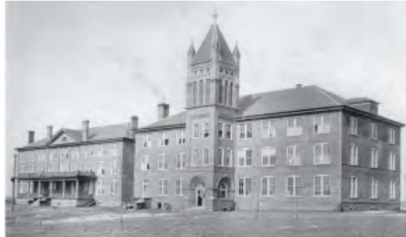
Lander College building, 1904-05

Lander offers high-demand and market-driven programs to ambitious and talented students in, around and out-side of South Carolina. These programs are delivered in a rich liberal arts environment to produce highly qualified and marketable graduates. This is accomplished by creating graduates who are well rounded and prepared to continue their education or launch their careers.