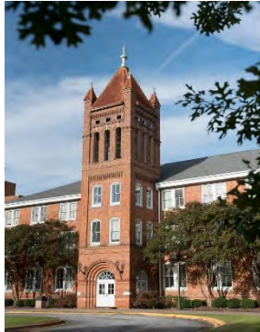
Lander Bell Tower 2019

Lander University was founded in 1872 and on July 1, 1973, became a state-supported higher education institution incorporated by an act of the South Carolina General Assembly and signed into law by then Governor John C. West.