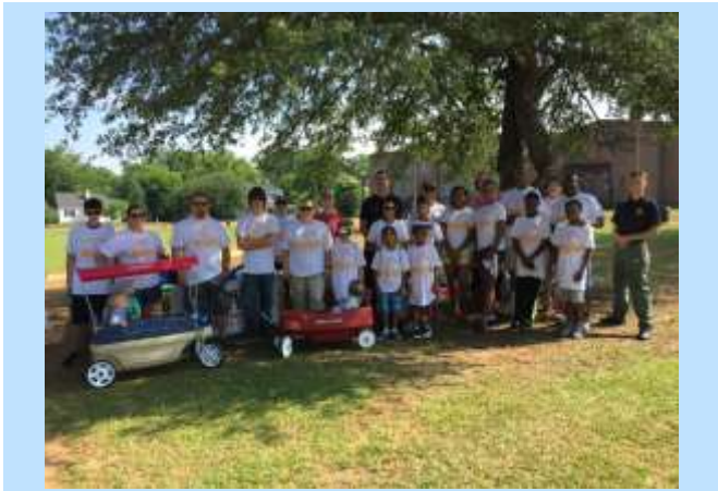
Fairfield County First Steps held its first Walk for Literacy in conjunction with the Fairfield County Library Kick-off to Summer Reading.

*CTK program data is for June-August 2015, whereas CTK fiscal data includes expenditures from July 1, 2015 through June 30, 2016.