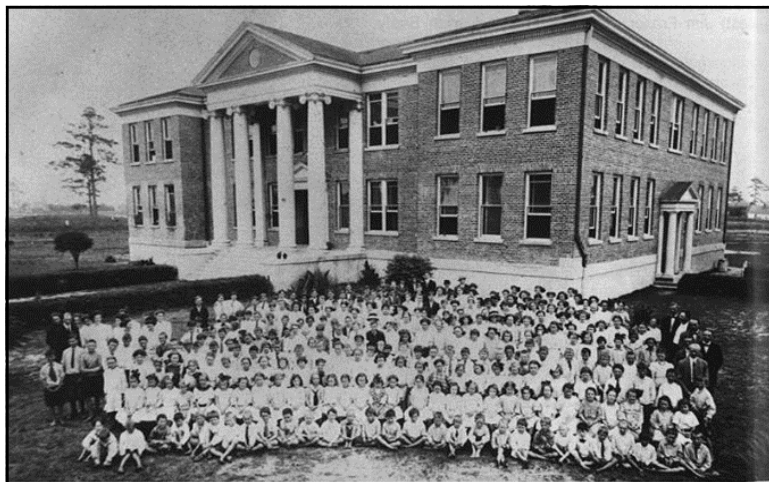
Winyah Indigo School, c. 1915