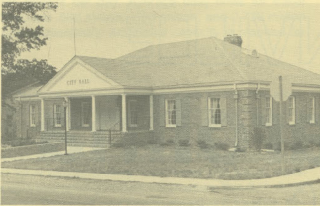
Simpsonville City Hall