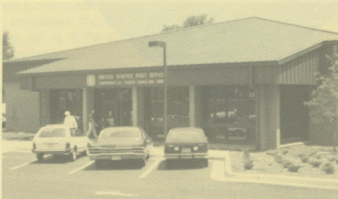
Simpsonville Post Office