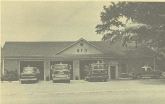
Simpsonville Fire Department