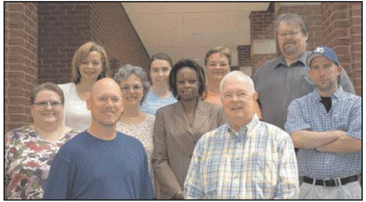
The staff of Communications Services, Printing Services and the Mail Center.