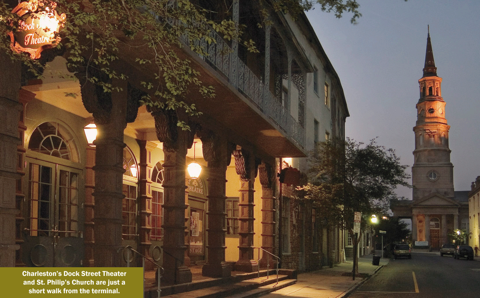
Charleston's Dock Street Theater and St. Phillip's Church are just a short walk from the terminal.

As a point of embarkation and debarkation, the Port of Charleston provides excellent facilities to make for a smooth and secure transition between air, ship and shore. Charleston has a beautiful airport that welcomes visitors from all over the world. Our terminal is only a short distance from I-26. The cruise terminal features on-site vehicle storage, free shuttles, luggage services, and experienced staff; plus, passengers will have the added benefit of access to the same lodging, food, shopping, and fun in the downtown area as other visitors. This makes their free-time all the more pleasant. Both passengers and cruise operators will appreciate that the open sea is only one hour away. With a clear vision of Charleston's future in the cruise business, the S.C. State Ports Authority is making major investments to continually improve service to passengers and lines. A new FMT gangway has recently been installed and a new cruise terminal is being developed with an anticipated opening late in 2012.