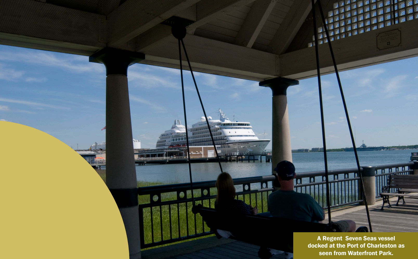
A Regent Seven Seas vessel docked at the Port of Charleston as seen from Waterfront Park.

Charleston: Ranked as a Conde Nast Traveller top 10 U.S. travel destination for 17 consecutive years.