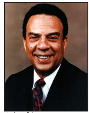
Andrew J. Young

Ambassador Young was a leading civil-rights activist in the 1960s who became a trusted aide to Martin Luther King Jr. He was with King when the civil rights leader was assassinated in Memphis, Tenn., on April 4, 1968.