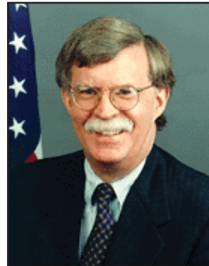
John R. Bolton