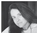
Naomi Shihab Nye