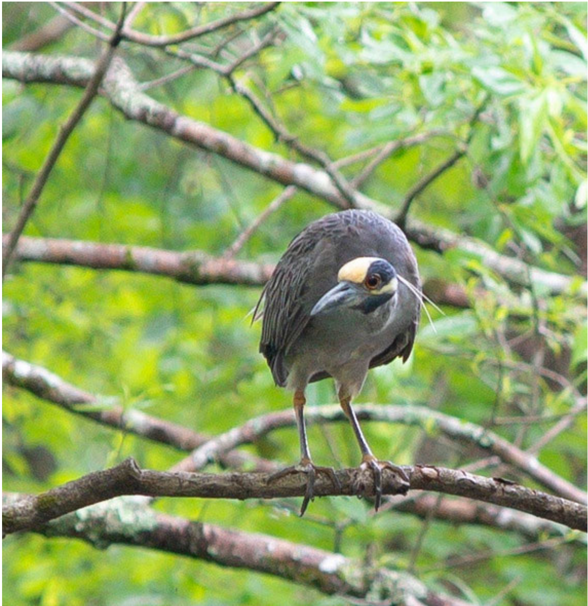
Yellow-crowned night heron

If you are not already a subscriber, no worries!