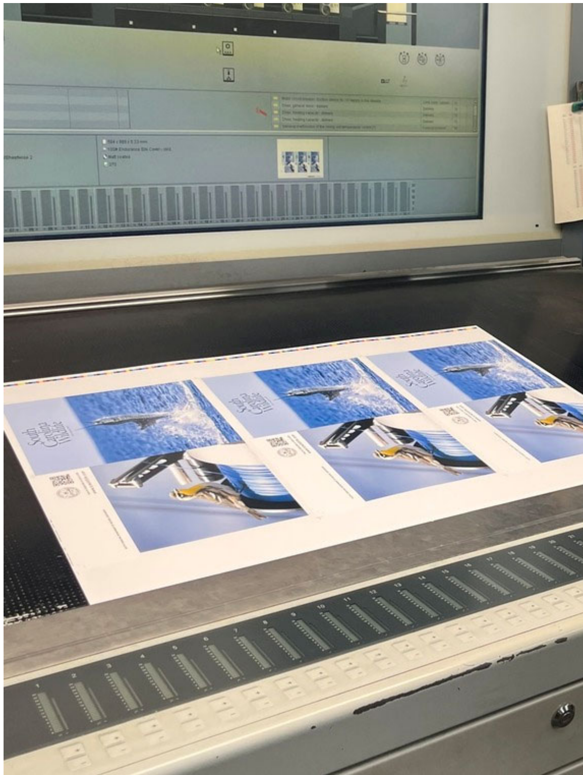
Printing the cover!