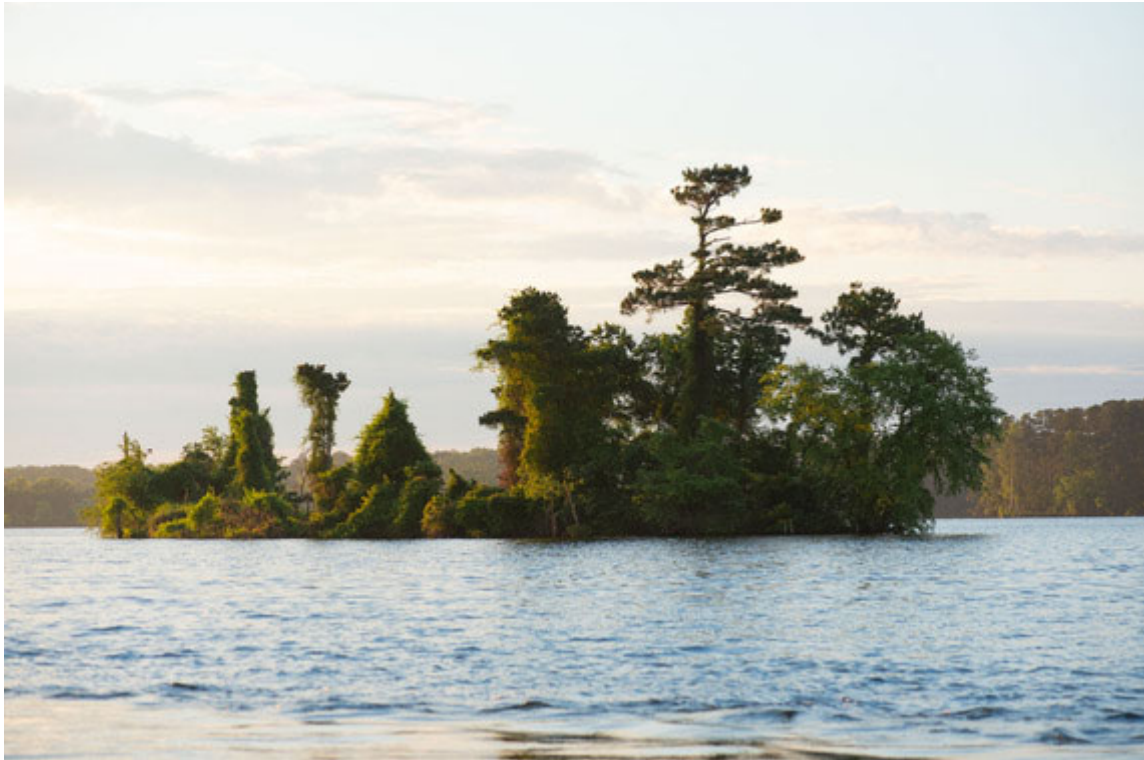
Lake Murray sunrise.