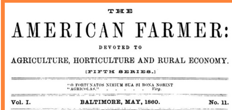
May 1860 edition cover page of The American Farmer . See excerpts and a link to the full issue below!