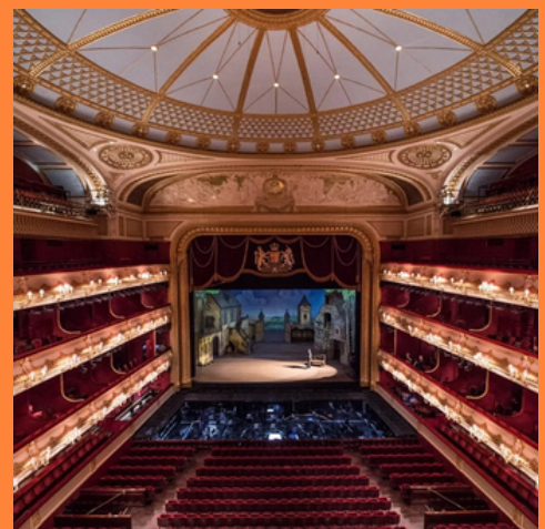
Covent Garden Theatre in London

This portrait of Irish stage actress Elizabeth O'Neill was published by John Bell c. 1820. O'Neill was one of the most popular actresses of the Regency Era in the early nineteenth century. This depiction of her notes her performance at Covent Garden Theatre in London, England. It is possible that James Henry Hammond, on his European tour and visit to England, saw performances at this theatre. Although O'Neill had retired from the stage by Hammond's visit to Europe, her popularity and impact on the performing world continued. It is possible Hammond purchased this commemorative card because of O'Neill's continued fame.