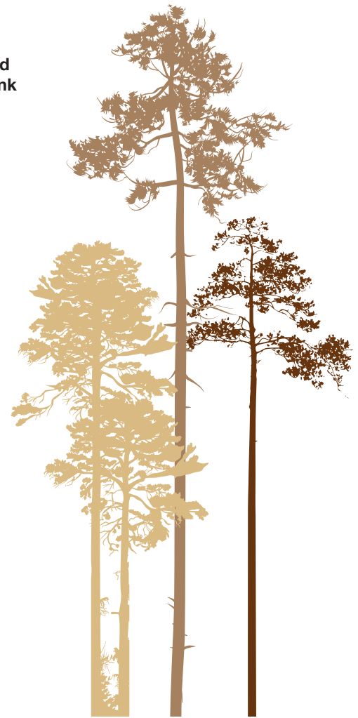
Delivered Value Rank, by County