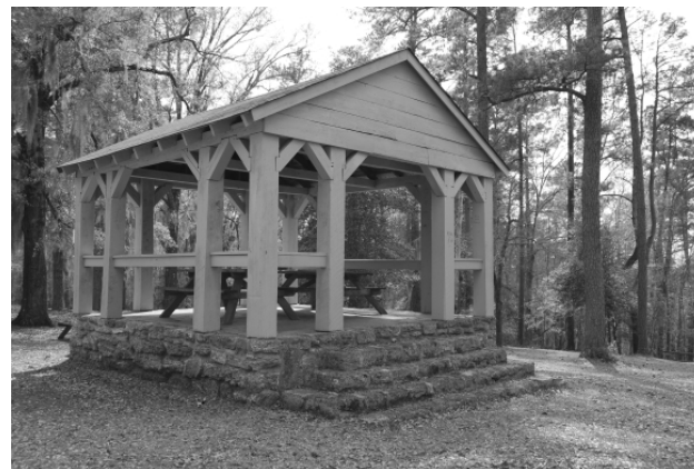
Coquina was used for shelter #5's foundation and steps. This shelter was started by Company 421 and finished by Company 4475.

Three CCC Companies helped build Poinsett: Companies 421, 4475 and 2413. Company 421 consisted of young Caucasian men aged 18-25. They worked on the park from October 20, 1934 to August 16, 1935. This Company is also responsible for the name Poinsett State Park. The enrollees came up with a list of possible park names and voted. The name Poinsett won. Company 4475 consisted of young African American men aged 18-25. This Company worked on the park from August 1935 to November 1935. Company 2413 consisted of older men, Veterans of World War I. This Company worked on the park