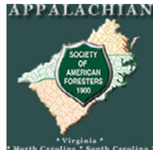
South Carolina Division, Appalachian Society of American Foresters