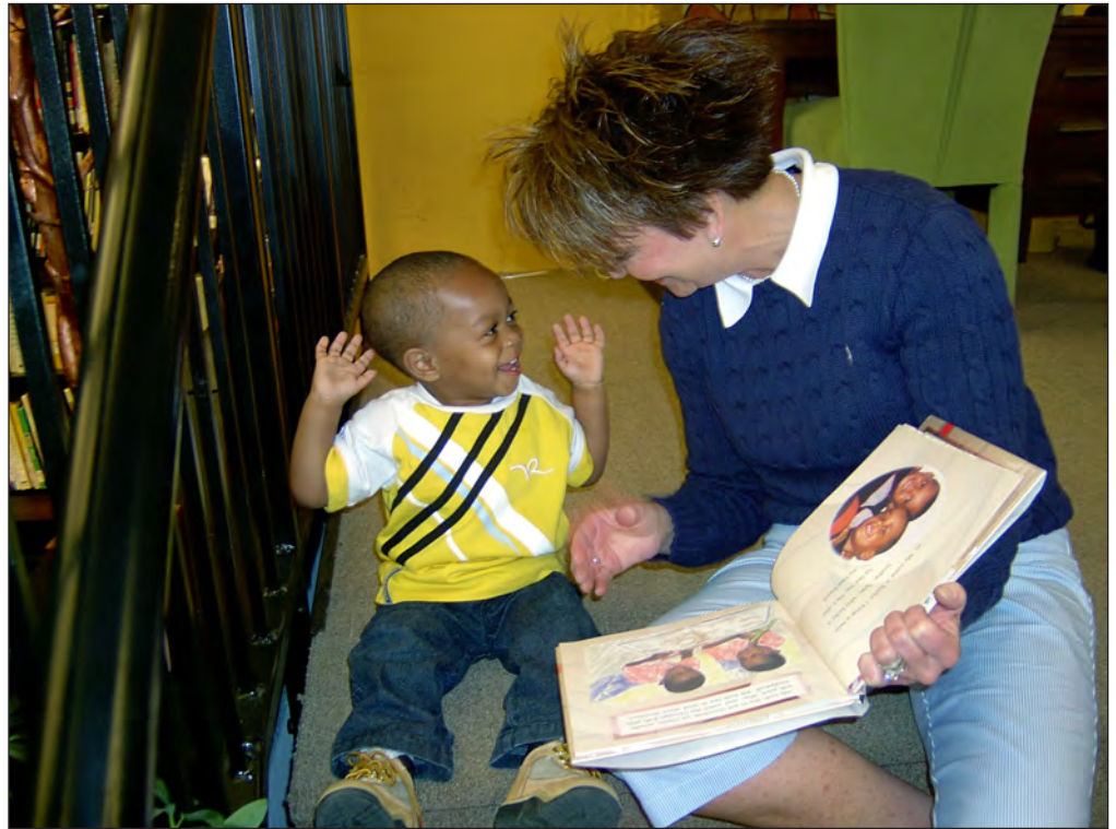
Winner of the Day in the Life of South Carolina Libraries photography contest. Lee County Public Library.

Every day, our state's public libraries deliver millions of dollars in resources and support that meet the critical needs of our communities.