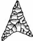
Yadkin/ Larger Triangular