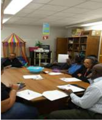
MCFS Board Members

Marlboro County First Steps, Marlboro County School District, and Marian Wright Edelman Library continue to collaborate for the benefit of children & families of Marlboro County by hosting events throughout the year.