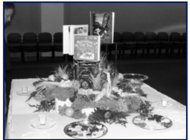
Reception at the new Charleston County Library.

Another trustee noted, “This was a great opportunity for me to learn, and not just from the experts. I learned a lot from other trustees as we sat around chatting informally after the sessions. Many of the problems and challenges are the same all over, and I really benefited from hearing about the experiences of trustees from other libraries.”