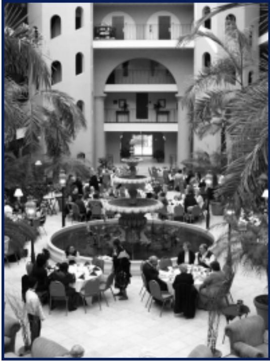
Lunch in the atrium of the Embassy Suites Hotel.

Trusteeship in South Carolina in the 21 st Century” focused on the breakneck pace of change in South Carolina’s public libraries and how public library trustees can keep up, and even get ahead.