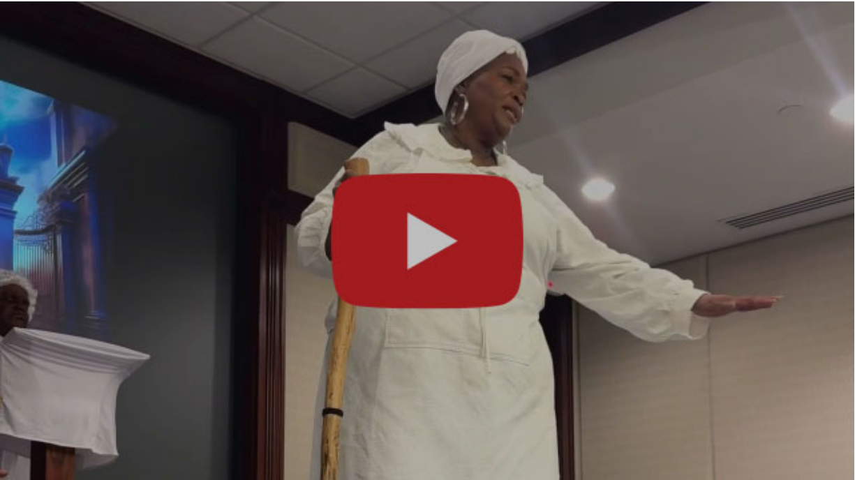
Gullah Kinfolk Traveling Theater Performance at Liberty Day 2026