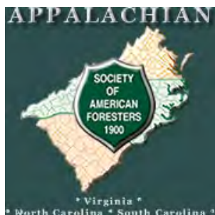
South Carolina Division, Appalachian Society of American Foresters