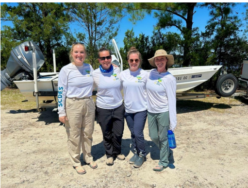
Aquatic Science Division Wraps Up 2025 National Coastal Condition Assessment Survey

As part of this transition, please ensure any previously saved or bookmarked links are updated. The new cloud-based URLs are active and available: ePermitting.des.sc.gov .